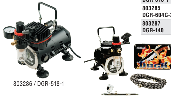
803286 / DGR-518-1